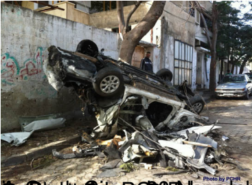
14th Day of Violence in Gaza by Israeli warplanes killing 5 Palestinians in al-Sabra neighborhood November 2012 16 November 2012 15